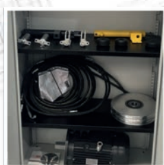
Critical Spares Package Supports in-house maintenance