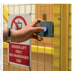
Controls Positive-pressure or despatch-and-receive