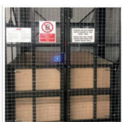
Bespoke Sizes Single-pallet to 3-metre platforms