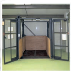
Lift Car Sides 1100mm to 1800mm-high