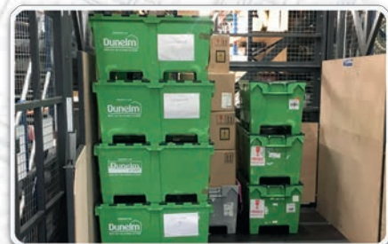
RETAIL: ENHANCED CONTROLS AND POWER PACK FOR CONTINUOUS RELIABLE EFFICIENCY – TO ENSURE YOU GET YOUR PRODUCTS TO YOUR CUSTOMERS ON TIME, EVERY TIME