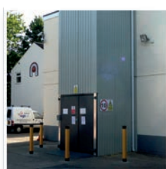
Exterior Install Maximises interior space