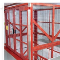
Bespoke Colours To suit your build scheme