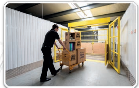
SELF STORAGE: SIMPLE AND SAFE OPERATION; HIGH-QUALITY FINISH AND BESPOKE PAINT COLOURS TO MATCH YOUR CORPORATE STYLE; PIT-FREE, LOW-MAINTENANCE DESIGN; 1.5-DAY RETROFIT/NEW-BUILD INSTALL