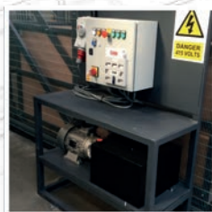
Power Supply 3-phase or 240V mains