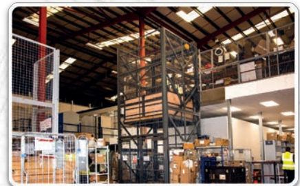
INDUSTRIAL: QUALITY, STRESS-ENGINEERED LIFTS FOR HEAVY-DUTY WAREHOUSE/FACTORY OPERATION; HIGH POINT-LOAD, INCREASED SWL OPTIONS, INDUSTRIAL POWERPACKS; IP 65-RATED ELECTRICS; OPTIONAL IMPACT-PROTECTION SYSTEMS