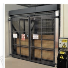
Power Pack Wall or floor-mounted