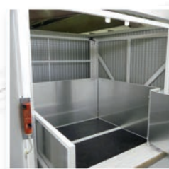
Car Lining Ply or aluminium