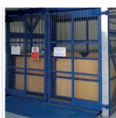
Access Ramp 500mm or 1000mm