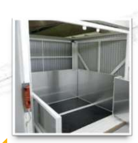
Car Lining Ply or aluminium