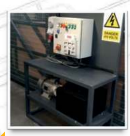
Power Supply 3-phase or 240V mains