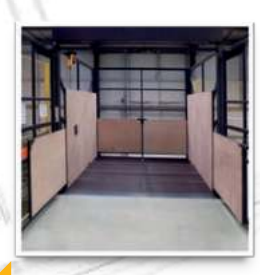
Outer Gates Extra tall gates