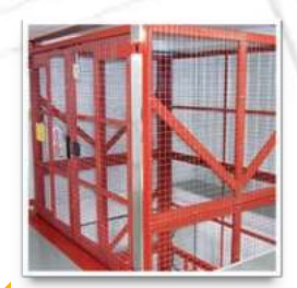
Bespoke Colours To suit your build scheme