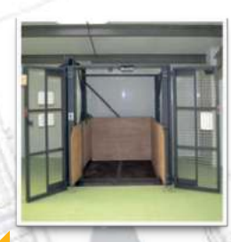
Lift Car Sides 1100mm to 1800mm-high