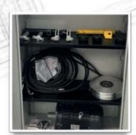
Critical Spares Package Supports in-house maintenance