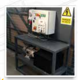
Power Supply 3-phase or 240V mains