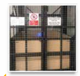
Bespoke Sizes Single-pallet to 3-metre platforms