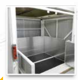
Car Lining Ply or aluminium